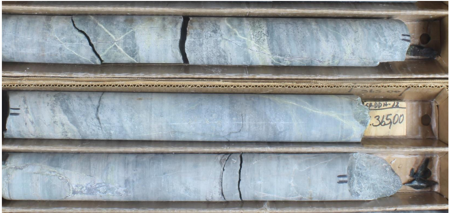
Hole SP-DDH-12, 364.00m to 365.50m. From a 56 m interval of andesite with various intercepts with chlorite-actinolite-epidote and disseminated magnetite-chalcopyrite-pyrite.