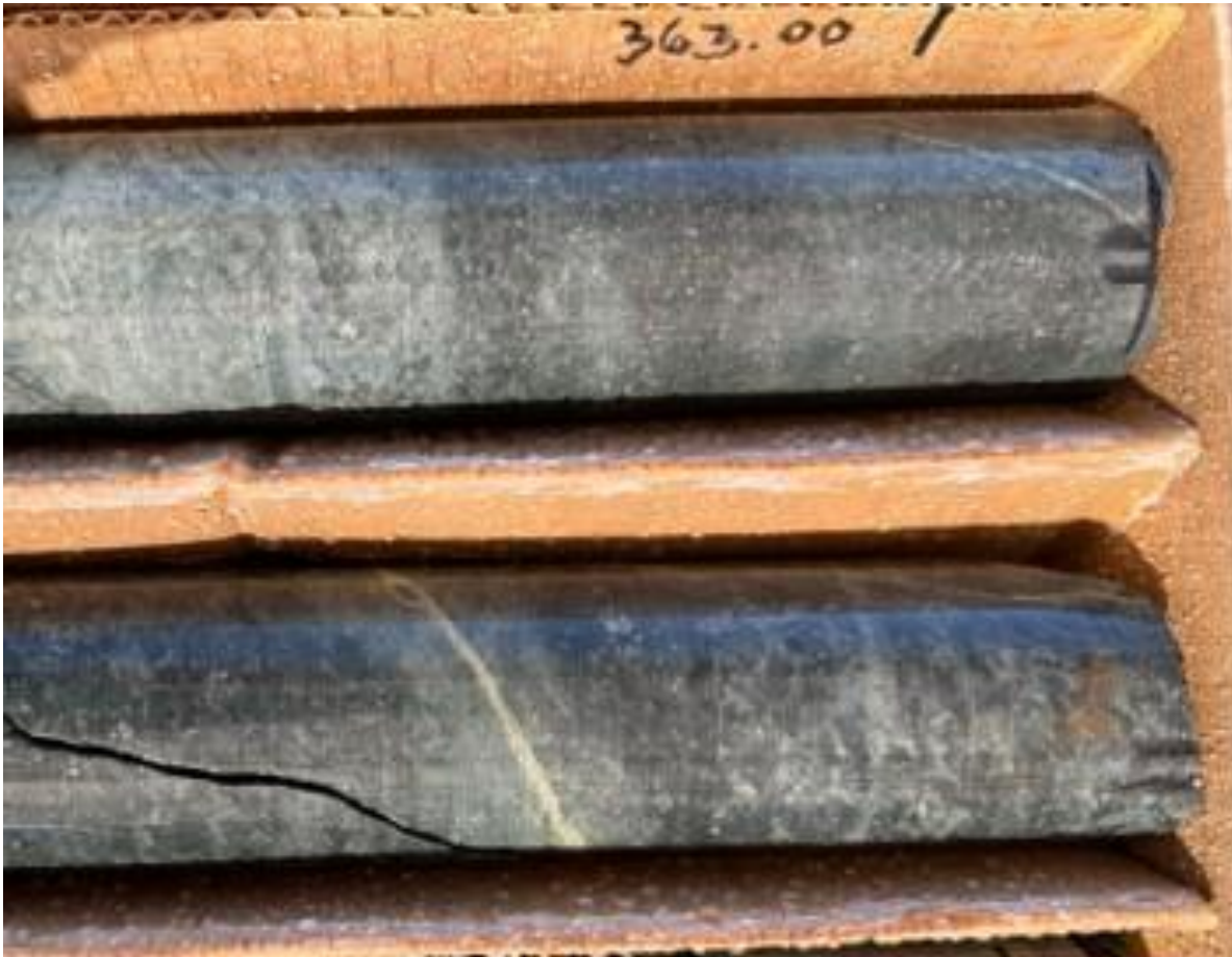
Hole SP-DDH-12, at 363 m. Disseminated chalcopyrite and pyrite. From within a 56 m interval of andesite with various internal intervals of chlorite-actinolite-epidote with disseminated magnetite-chalcopyrite-pyrite.