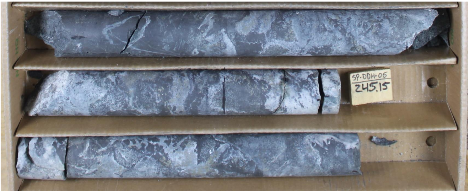
Hole SP-DDH-05, 242.02m to 245.62m. magnetite replacement with quartz-scapolite and pyrite-chalcopyrite. Part of a wider interval from 235.70m to 253.55 m.