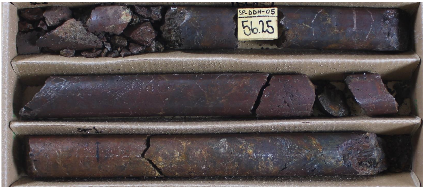
Hole SP-DDH-05, 56.00 to 57.30m. Part of an interval from 51.45 m to 57.55 m of mantos with an estimate 80% of magnetite-martite.